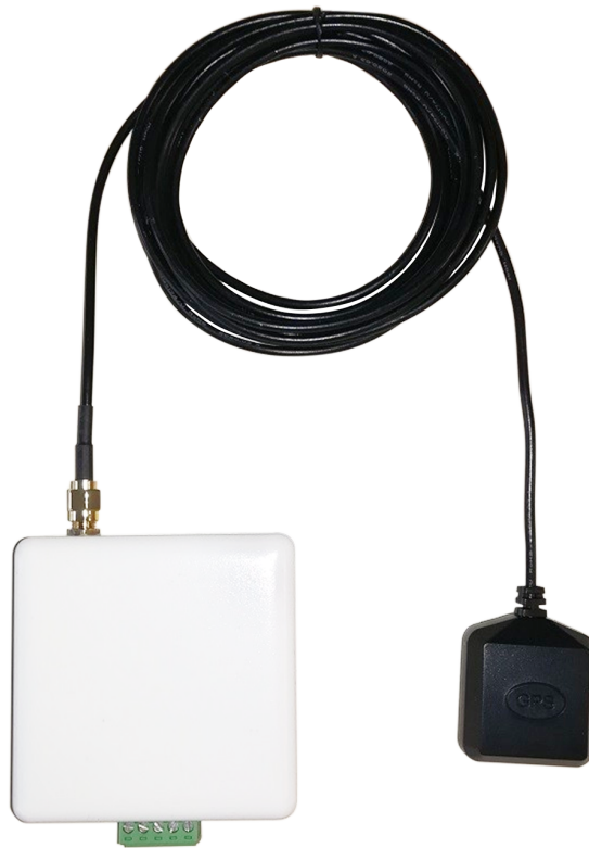
Fig. 1. View of STR receiver with antenna connected

The STR receiver is a device designed to continuously receive a satellite signal containing highly accurate information on the current real time. The processed satellite signal is made digitally available on the built-in RS-485 interface and can be used to synchronise the real time of the device connected to this interface.