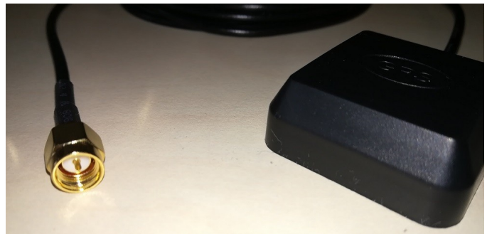
Fig. 4. GPS antenna socket and GPS antenna